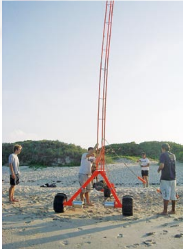
Assembly complete. Ready to deploy.

Potentially applicable for homeland security, the vehicle could locate packages of drugs or mines attached to the undersides of vessels.