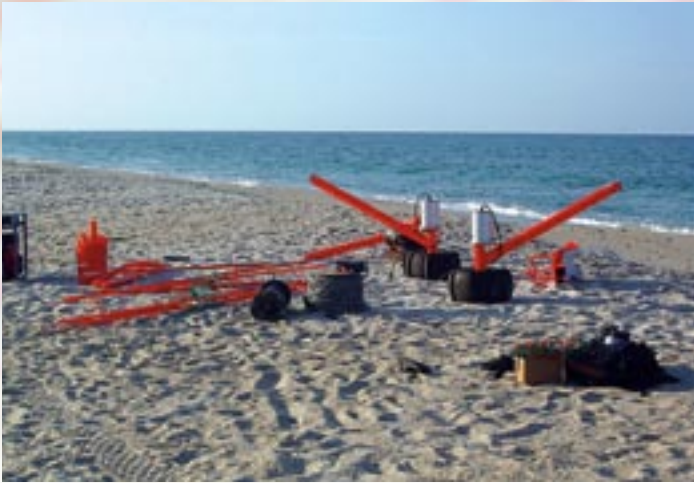
MARC-1 before assembly