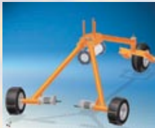
left: MARC-1 conceptual design rendering.

"It will have two cameras, one on the front and one on the side," he says. "It will 'fly' underwater, inspecting a pipeline, for example, with the side camera, and 'look' forward for obstructions." Potentially applicable for homeland security, the vehicle could locate packages of drugs or mines attached to the undersides of vessels.