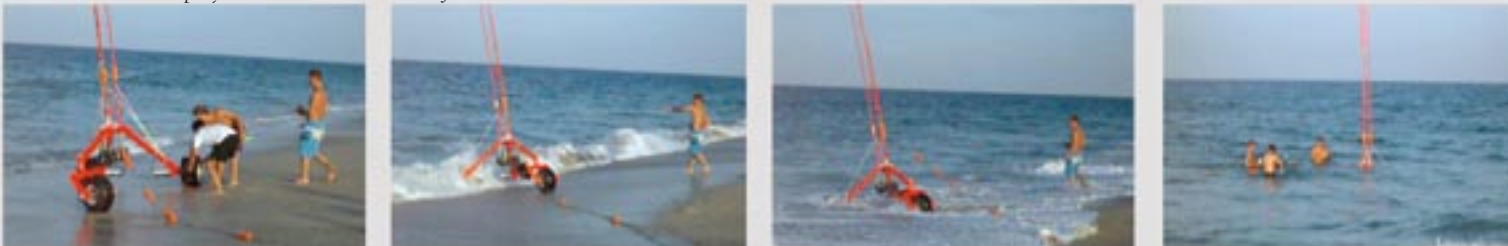
The MARC-1 is deployed on an ocean test ... after several maneuvers it returns to shore.