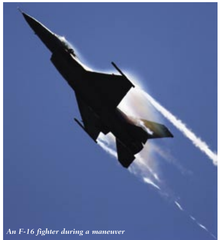
An F-16 fighter during a maneuver